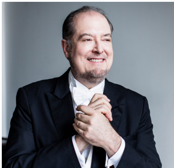
Garrick Ohlsson