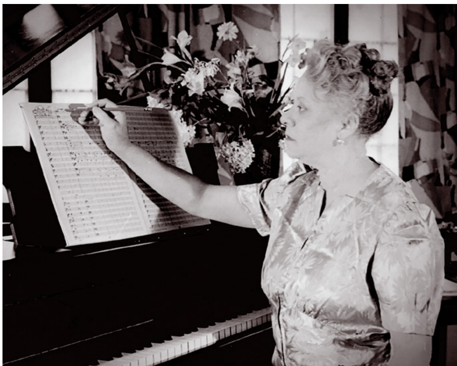
A photo of Florence Price from the Arkansas Educational Television Network (1941)