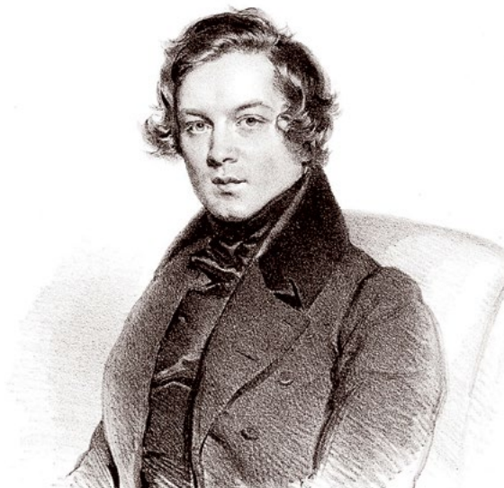
Lithograph of Robert Schumann by Joseph Kriehuber Schumann (1849)